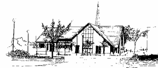
Holy Trinity Shaw